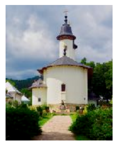
Romanian Tour 2017

Founded in 1789 and despite a fire in 1900, this magnificent monastery is now home to 400