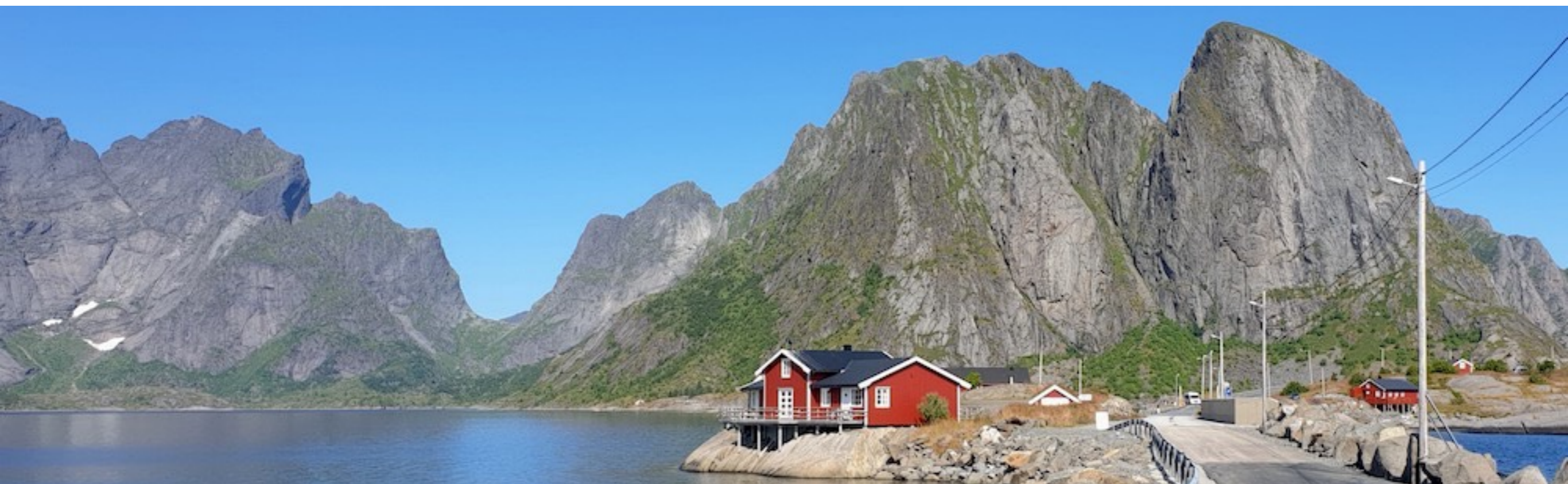
E10 Vista, Lofoten Islands