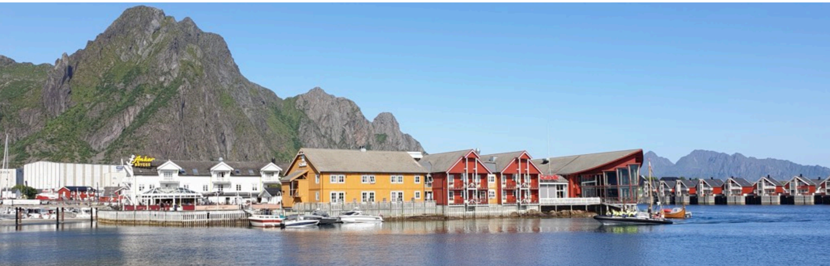
Harbour at Svolvær