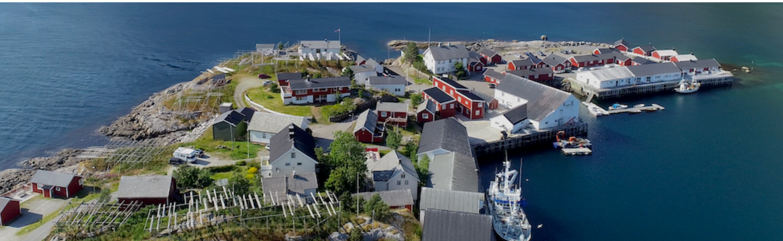
Aerial footage of south Lofoten village - Hamnøy