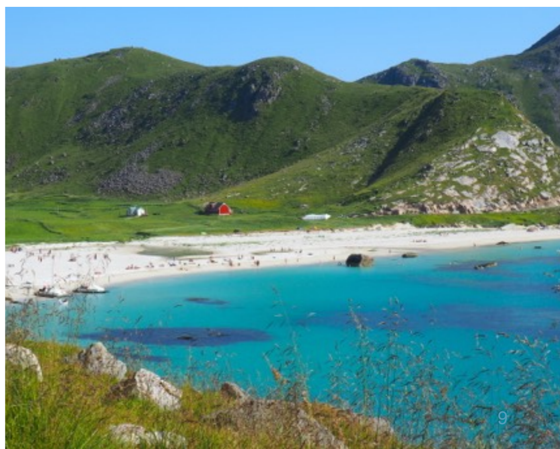
Right; Haukland Beach