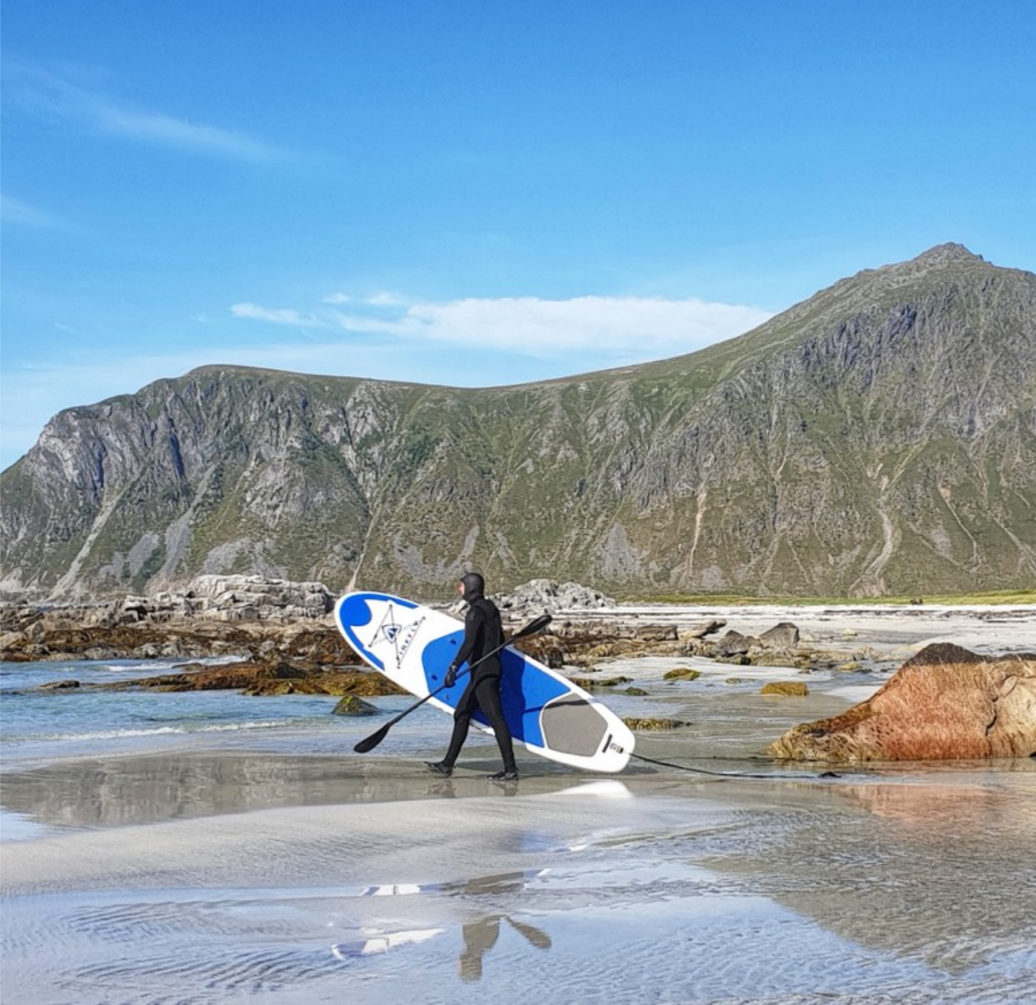
SUP at Flakstad beach