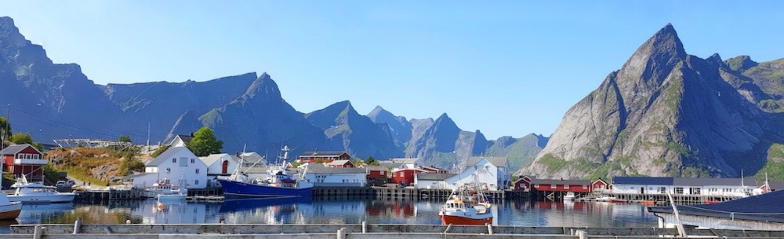
Hamnøy fishing village