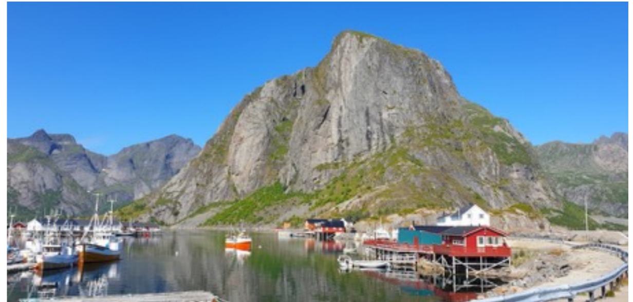
Bottom; Tiny fishing harbours trying to make a living