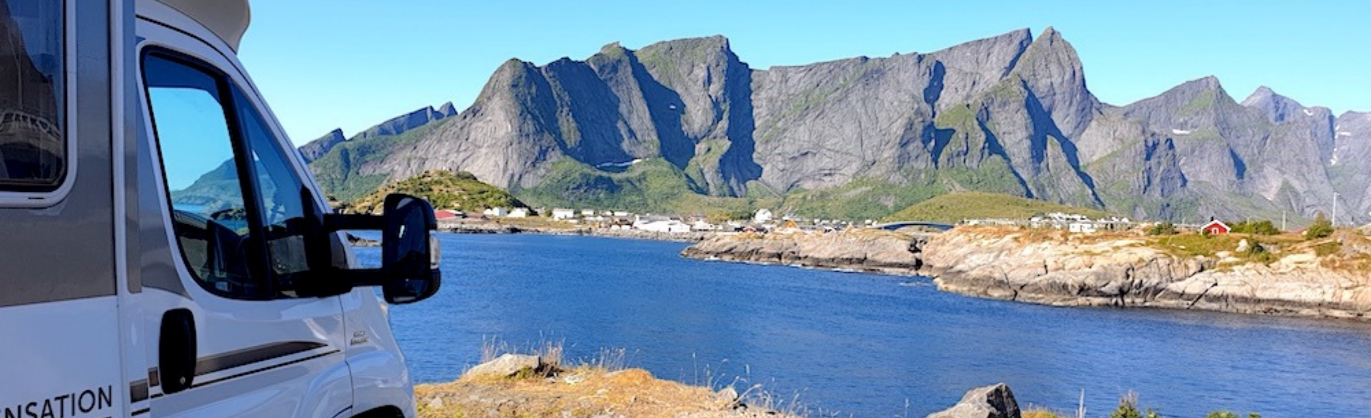
Scoobie overlooking Reine from Hamnøy