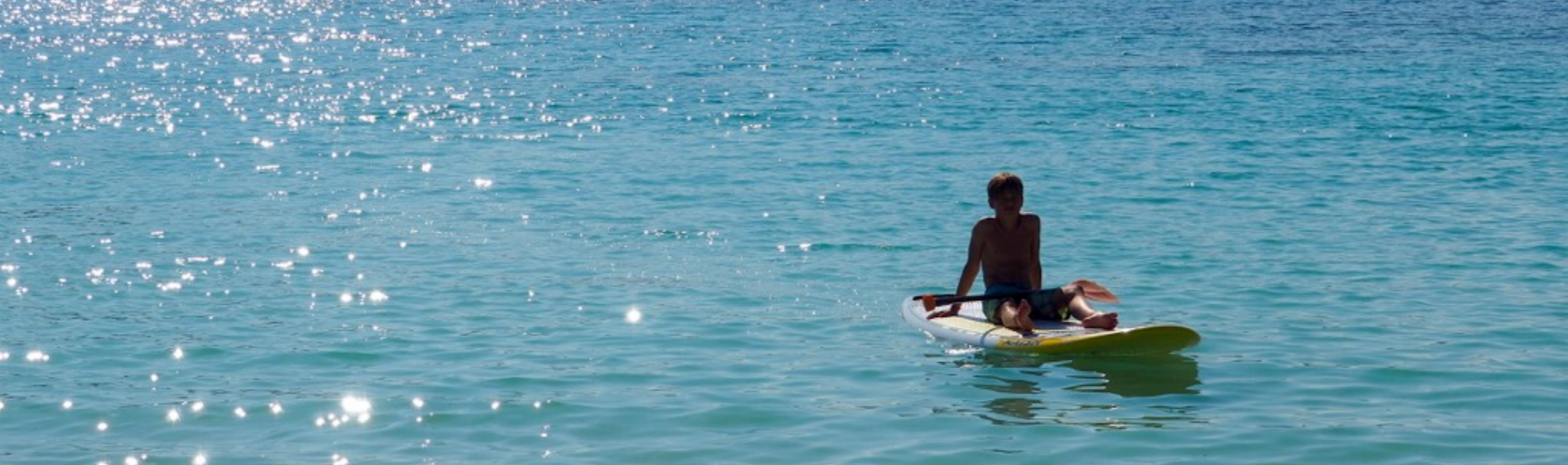
SUP paradise at Lofoten's best beaches