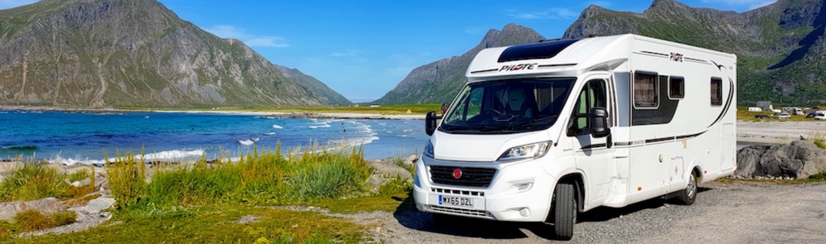
Scoobie parked at Flakstad rest area