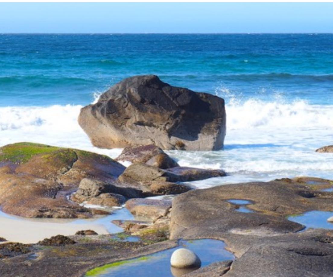
Top; Flakstad Beach