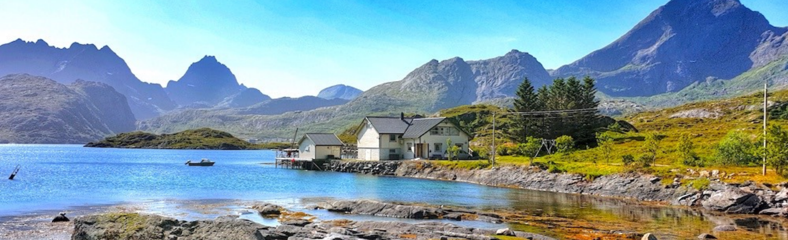
Iconic mountain scenery of the Lofotens